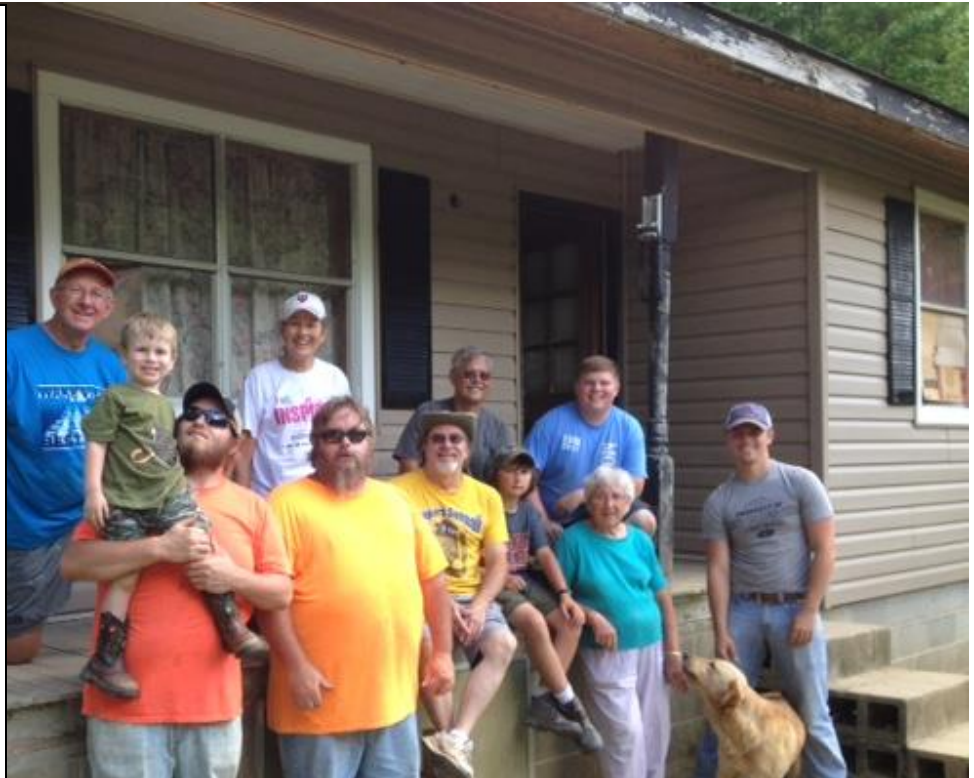
The Mt. Comfort United Methodist Church Missions team traveled to the Henderson Settlement in Frakes, Kentucky, June 4-9 and completed a work project for a family in need.