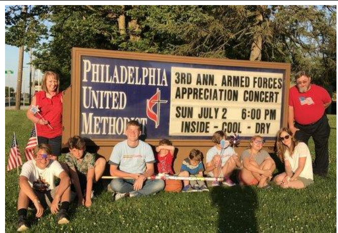
Club 56 meets at Mt. Comfort UMC on Sunday afternoons, 4 – 6 p.m. Above, Club 56 members and chaperones pose outside of Philadelphia UMC, where they attended an Armed Forces Appreciation Concert on July 2.

And finally, Club 56 has a special surprise for the congregation coming up in a few short weeks. We can't give you any details at this time, but it will be revealed during the Sunday morning service in the next few weeks, so – see you in church, and watch for Club 56!!